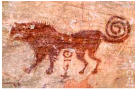
Fig. 23. Ancient Libyc script similar to Tifinagh below a lion from the Horse Period, southern Tassili. Note lion's tail in form of spiral.

The Camel Period introduces the last phases of rock art in the Sahara. Apart from camels, both engravings and paintings depict a few cows, herds of goats, mounted and dis-