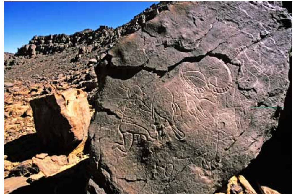
Fig. 6. Engraving of a bubalus (ancient, now-extinct buffalo) with huge characteristic horns, surrounded by a group of dog-headed men in the Oued Djerat.