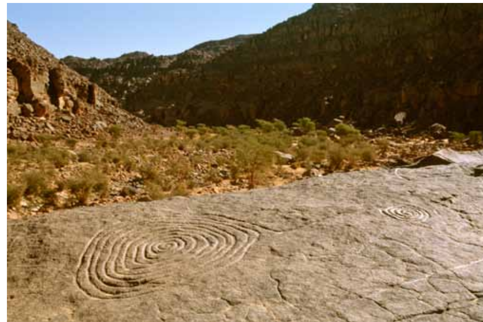
Fig. 10. Geometric designs on a boulder in the Oued Djerat.

Pastoral Period art, comprising both paintings and engravings, commenced in isolated areas and then spread rapidly through the Sahara. The art presents a very different picture to the ethereal world of the Round Heads: Humans become largely dependant on animal