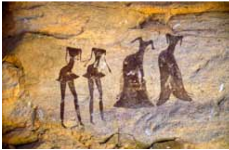
Fig. 22. Painting from the Horse Period showing women with long flowing dresses (right) and two young warriors. These figures originally would have had white 'stick' heads which have now disappeared.

armed with metal-tipped spears or javelins are painted in a single colour. Women, when depicted, also have 'stick' heads and wear flowing dresses (Fig. 22). Herders and cattle become less common, while wild animals tend to be those that survive on little moisture. Libyc script, the writing used by ancestral Berber peoples, appears, but is incomprehensible to modern Tuareg (Fig. 23) in its ancient form. This script is the only version in the Berber world that has survived to the present day.