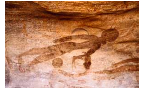
Fig. 15. Life-size floating/swimming figure from the Round Head Period.

husbandry and tend to dominate compositions. Scenes painted with brushes depict numerous cattle in variegated colours, and clothed people apparently of both black African and Mediterranean stock (Hachid, 1998; Muzzolini, 2001). There are herders and men hunting with bows (Fig. 17), scenes of camp life with women