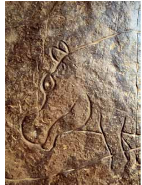
Fig. 9b. Baby hippopotamus from the Large Wild Fauna Period near the Oued Djerat.

Fabrizio Mori, Henri Lhote and Malika Hachid and the Recent/Short chronology (6,000 BP) proposed by Alfred Muzzolini and Jean-Loïc Le Quellec. The art itself comprises paintings and engravings on exposed rock faces, and includes pictures of wild and domestic animals, humans, geometric designs, Libyc and Tifinagh inscriptions (ancient and recent Tuareg/Berber script) and a very few plants and trees. Many scenes exist, but these lack background details such as hills, rivers and foregrounds to draw images together: probably the earlier paintings and engravings are all symbolic. While many images reflect large animals such as elephant, giraffe, ostrich and lion, almost certainly they were not drawn for art's sake. Compositions may depict huge animals with tiny men (Fig. 5), men with animal heads and dog-headed men involved with large animals (Fig. 6). Engraved spirals are often associated with animals (Fig. 7) and sometimes with people. Even painted camp scenes with naturalistic cattle, people and objects must have held meaning for the artists (Holl, 2004).