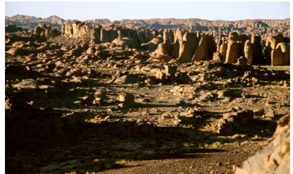
Fig. 2. Typical Tassili moonscape featuring so-called forests of stone.