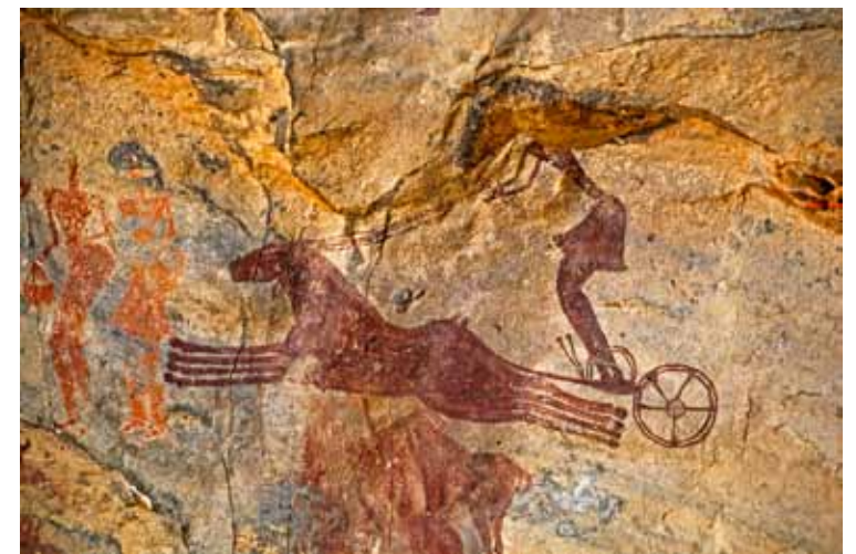
Fig. 21. Detail from fig. 20 showing a horse-drawn chariot and charioteer.