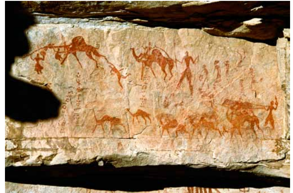
Fig. 24. Red paintings of camels and armed people from the Camel Period.

Tourists didn't visit the southern Park during the war against Islamic fundamentalists during the 1980s, but today their numbers are increasing. Fortunately, much of the best art is difficult to access, requiring guides, donkeys or camels and long treks. What does the future hold?