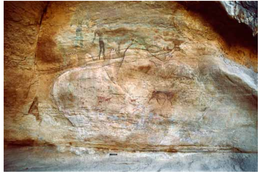
Fig. 5. Painting from the Round Head Period featuring a large mythical animal and tiny human figures.

Pottery found in Niger's nearby Air Mountains has been dated to 11,500 BP, the most ancient pottery ever discovered, along with the Jomon civilisation of Japan. About 7,000 BP, domestic cattle as well as sheep and goats, first appeared in the Central Sahara, possibly brought in from the Middle East or by Nilotic peoples from the southeast (Brooks et al , 2005). Some researchers also believe that the indigenous African aurochs may have been domesticated in the Sahara. At this time some