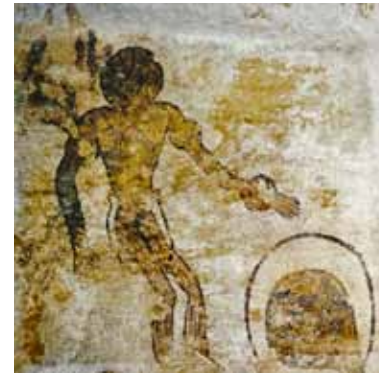
Fig. 14. Paintings like these from the Round Head Period may have led popular author, Erich von Daniken to write about paintings of extra terrestrial astronauts.