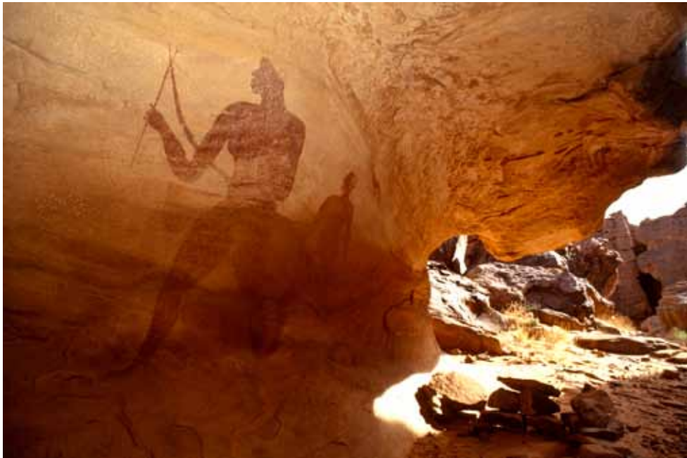
Fig. 17. A life-size painting of a hunter with a bow and arrow followed by a second figure from the Pastoral Period.