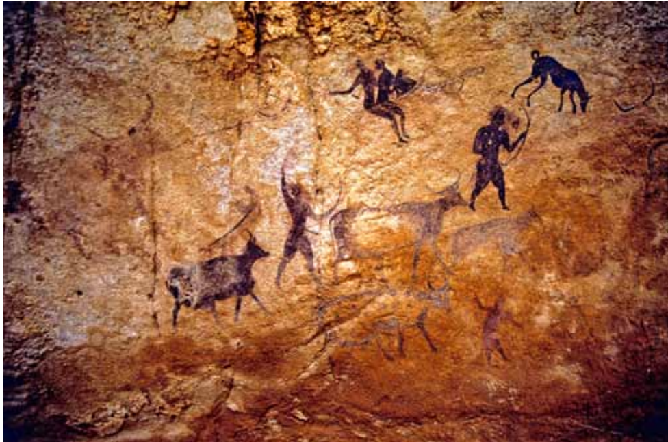
Fig. 18. Scene depicting camp life with women, animals and a dog.

origin. Black African peoples have largely disappeared, presumably taking their livestock to better watered areas in the south.