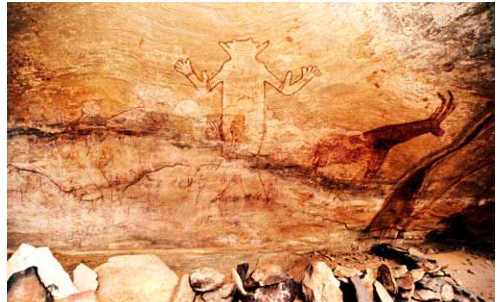
Fig. 16. A 3.5 metre high figure which Lhote named the "Great God of Sefar" approached from the left by women with raised hands.

and children, sheep, goats and dogs (Fig. 18). Attitudes towards nature and wild animals have changed and property, particularly cattle, has become man's most important possession suggesting stratification of society on the basis of wealth. By about 4,000 BP, most of the art appears to show only people of Mediterranean