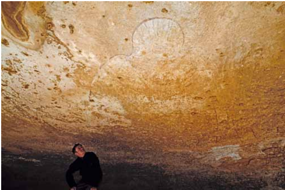
Fig. 13. A giant human figure with a single eye, standing several metres tall, dwarfs a visitor to the southern Tassili. Henri Lhote (jokingly) called these strange alien looking figures "martians".