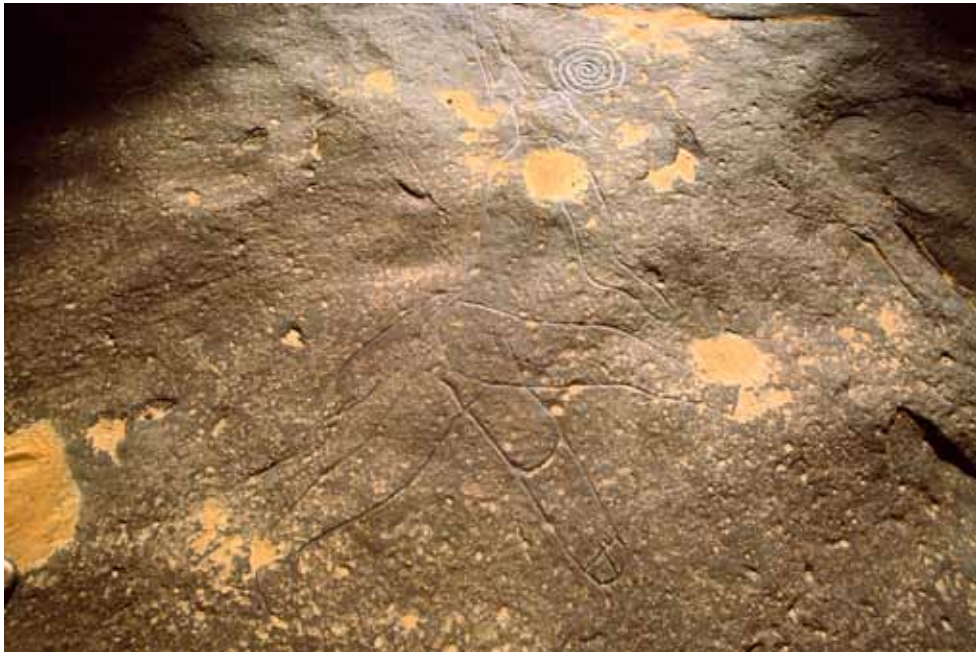
Fig. 12. Engraving of a masked man with a large penis in the Oued Djerat.