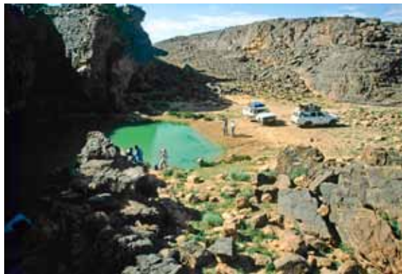
Fig. 1. One of the permanent water pools in the northern Tassili.

some 300 rock arches in the southeast (Fig. 3). Four species of fish survive in the pools and a variety of plants in the gorges includes 250 Saharan cypress ( Cupressus dupreziana ) known locally as Tarouts; one of the rarest plants on earth (Fig. 4) the Tassili cypress is an endemic species which only exists on the Tassili. It is also one of the oldest trees in the world after the barbed pine ( Pinus aristata ) in the USA. In addition to the living trees there are 150 dead Tarouts on the Tassili. Most large animal species have disappeared, but Barbary sheep ( mouflon ), gazelle, hyrax, wild cats and possibly cheetah are still present. There are over