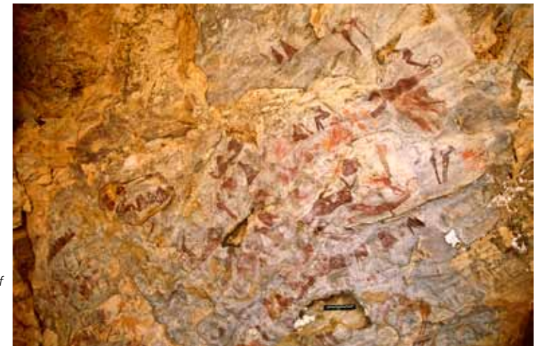
Fig. 20. Paintings from the Horse Period on the roof of a small cave in the north-western Tassili depicting horse-drawn chariots, warriors, cattle and women.