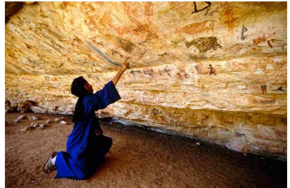
Fig. 25. Painting site from the Horse Period damaged by graffiti.