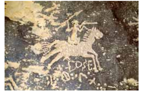
Fig. 19. Engraving from the Horse Period of Saharan art depicting a mounted warrior with a spear.

The Horse Period introduces the importance of men, particularly men holding weapons (Fig. 19). The artists were ancestral Berbers (Hachid, 2000) some of whose descendants are the modern Tuareg. The paintings and a few engravings commonly depict horses and horse-drawn chariots (Figs. 20 & 21), and warrior-like male figures with 'stick' heads. Men