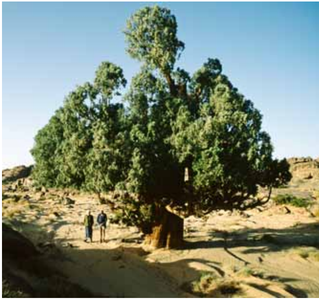
Fig. 4. The Tassili is the only place on earth where the Saharan cypress or tarout, one of the rarest and most ancient of trees grows.