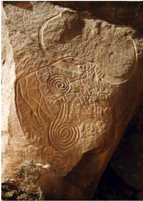
Fig. 7. Bubalus engraving superimposed by a double spiral, Oued Djerat.

Saharans adopted a pastoral lifestyle, while others continued to hunt and gather.