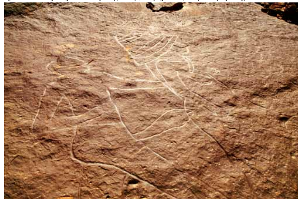
Fig. 11. Life-size engraving of human figure apparently portraying sexuality and probably mythology.