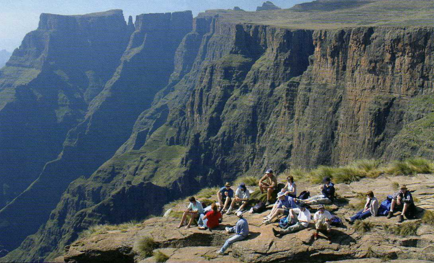
The spectacular natural beauty of uKhahlamba / Drakensberg Park attracts an increasing number of tourists. The site was inscribed on the World Heritage List in 2000